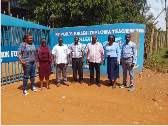
Award presentation at ST. Paul's Kibabii TTC, Bungoma County