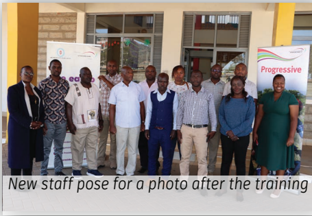
New staff pose for a photo after the training

The process of hiring new employees is crucial to an organization's success. Every organization needs enough personnel to handle the workload and service the growing customer base.