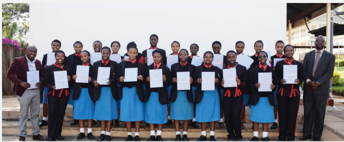
Starehe Girls students display their Bronze and Silver Award certificates