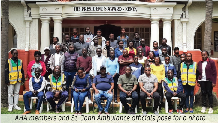
AHA members and St. John Ambulance officials pose for a photo

Award Holders Alumni (AHA- K) held First Aid Training sessions in partnership with the St John Ambulance Kenya at the President Award's Kenya headquarters.