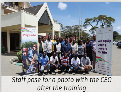
Staff pose for a photo with the CEO after the training

It was also an opportunity for the new recruits to familiarize with what is expected of them in their role.