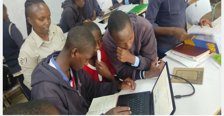
Online Record Book session with participants of Kirobon Boys' High School