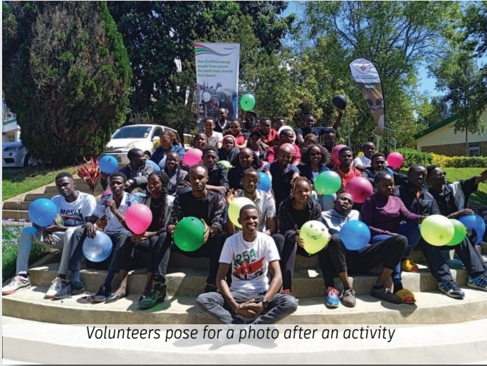
Volunteers pose for a photo after an activity

International Volunteer day is commemorated every 5th day of December worldwide. In the spirit of celebrating our volunteers, The President's Award-Kenya (PA-K) held a series of trainings to our participants who had expressed interest in becoming volunteers, Award leaders, assessors, activity coaches and Award supporters to help in the delivery of the Award.