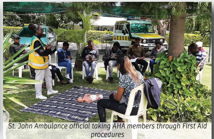
St. John Ambulance official taking AHA members through First Aid procedures