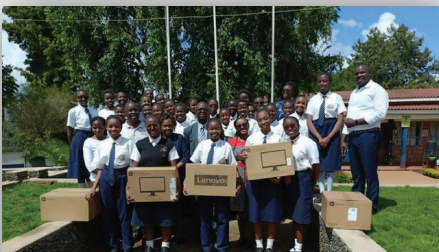
St. Marys Girls-Igoji participants pose for a photo with Principal, Programme and Co-ordination Officer when Computers were delivered by PA-K to be used for ORB