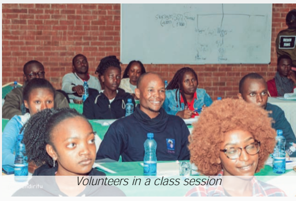
Volunteers in a class session