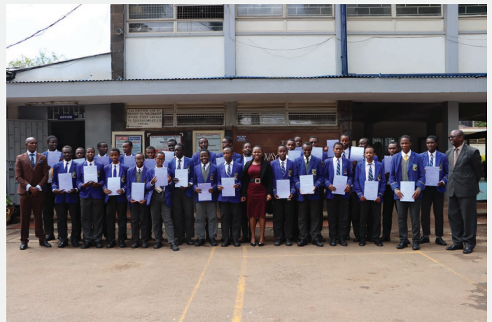
Bronze and Silver certificate presentation at Highway Secondary School Nairobi.